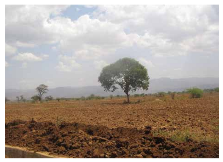
Plate 7: Leucaena leucocephala in Eldume irrigation scheme, Baringo County

Trees that are beneficial to agricultural crops by virtue of soil fertility improvement such as through biological nitrogen-fixation or those that do not have adverse negative effects on desired crop yields can be integrated with crops in paddies at wide spacing of up to 10 - 15 meters. Potential species include; Faidherbia albida, Moringa oleifera and Leucaena leucocephala .