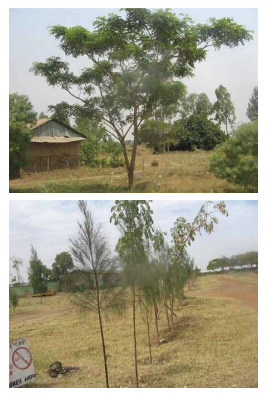
Plate 8: Amenity trees planted in homesteads and office compounds around an irrigation scheme