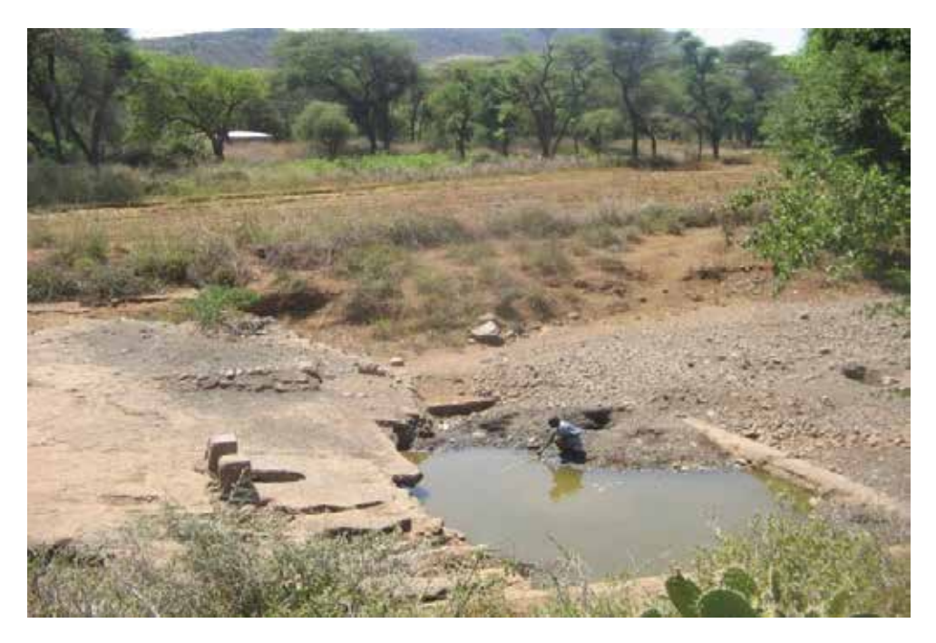
Plate 9: Deforested riverbanks that need re-vegetation

Many of the irrigation schemes in Kenya obtain water from rivers. The water either flows by gravity or is pumped using electric power generators. Every year, large quantities of soil are lost from banks of rivers used in irrigation through erosion due to diminishing woody vegetation cover resulting from deforestation. There is therefore need to re-vegetate riverbanks neighbouring irrigation schemes to ensure sustainable water flow. To ensure continued quality and quantity of water flow for irrigation, some appropriate tree species that can be planted along riverbanks include; Ficus sycomorus , Syzygium spp, Tamarindus indica , Terminalia brownii , and bamboo.