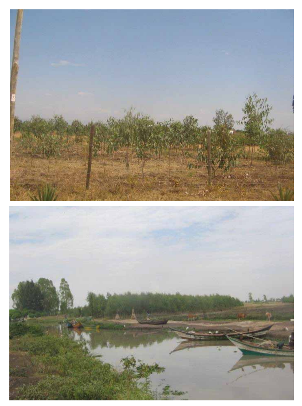
Plate 6: Woodlots within an irrigation scheme in Ahero, Kisumu County