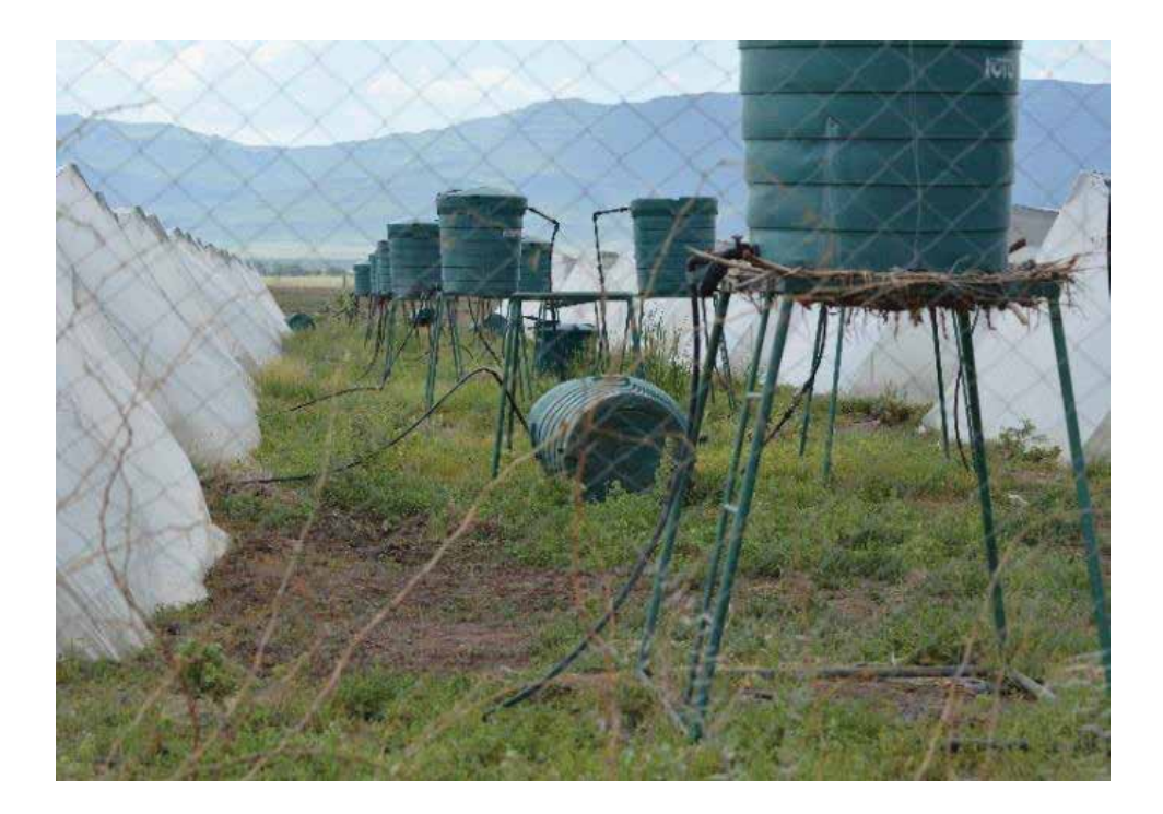
Plate 1: A drip irrigation system at Kaikor irrigation scheme in Turkana County

Kenya has an irrigation potential of 1,341,900 ha of which 170,000 ha (12.6 %) have been developed (Water Master Plan, 2012). After many years of low irrigation activities, the country has embarked on accelerated development of irrigation infrastructure and increased productivity per unit volume of water. However, most irrigation schemes involve mechanized clearing of vegetation and leveling of land to enable good performance of irrigation activities and management of water drainage. The clearing of vegetation leave swathes of land without tree cover. In the past, most irrigation schemes have not included clear blue prints on how to mitigate clearing of vegetation in their implementation plans. Reasons for inability of many stakeholders to internalize such contingencies include lack of guidelines to support integration of trees into irrigation schemes and belief that trees host crop pests that contribute to yield losses.