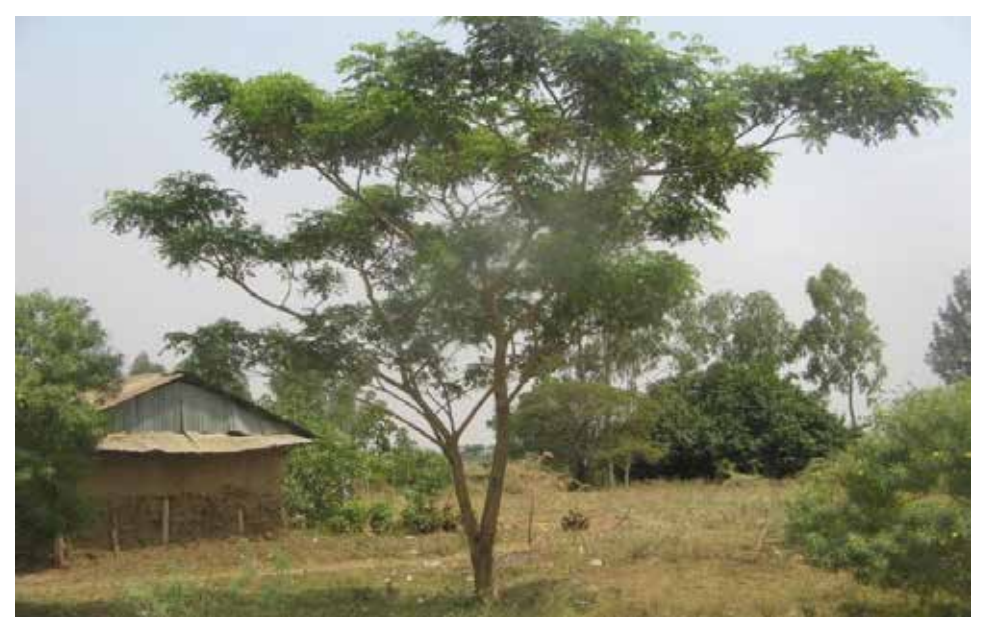
Plate 4: Trees planted for aesthetic value within a home compound