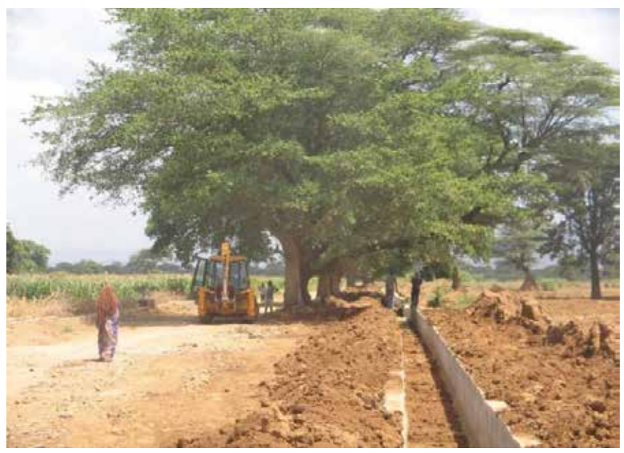
Plate 5: Construction of roads and laying of water pipes in an irrigation site

Irrigation development schemes involve construction of a wide range of structures to facilitate accessibility to the irrigation scheme and to improve efficiency of operations within the irrigation project site. Infrastructure projects include; building and grading of access roads, building of airstrips, building and rehabilitation of water pans as well as other water delivery and storage systems to facilitate operations in the project site. Sites for introduction or retention of vegetation components should be inbuilt in the plans of the wide range of structural developments under consideration.